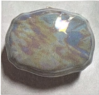
Mother of Pearl onto Porcelain Fire at 017